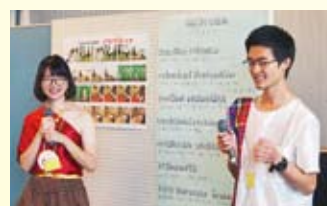
Singing Doraemon's theme song in Thai

Many families came to the event where they could enjoy picture book storytelling, songs, dances, and games with people from the U.S., Thailand, Kenya, and Nigeria.