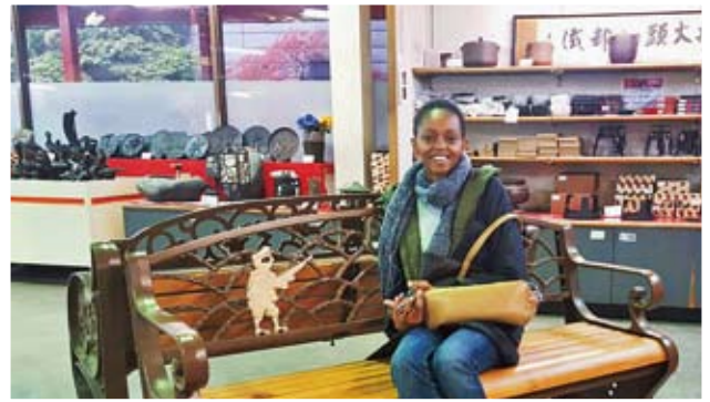
At the Iwachu cast ironworks

manufacturing process. There was also a 350 kg tea kettle, largest of its kind in the world.