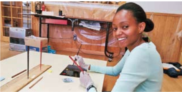
At the Appi-nuri lacquerware workshop