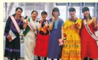
Trying on traditional clothes

There were a bunch of different programs at the event including World Area, where 28 booths representing countries around the world were set up, World Stage, Nepal Lunch, World Café, Bridge to the World Club, Kids' Corner, and Traditional Clothing Dress-Up Corner. With 4,446 people who attended the event, One World Festa was a great success!! Thank you to everyone who volunteered.